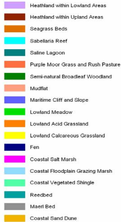
Map showing distribution of UK BAP Priority Habitat within Plymouth Unitary Authority